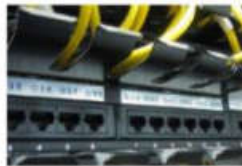
DDF Shelf Label