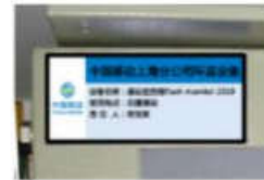
Fixed Assets Label