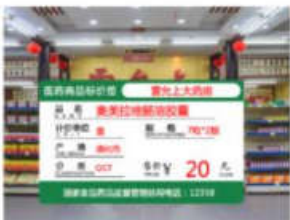
Colorful Price Label